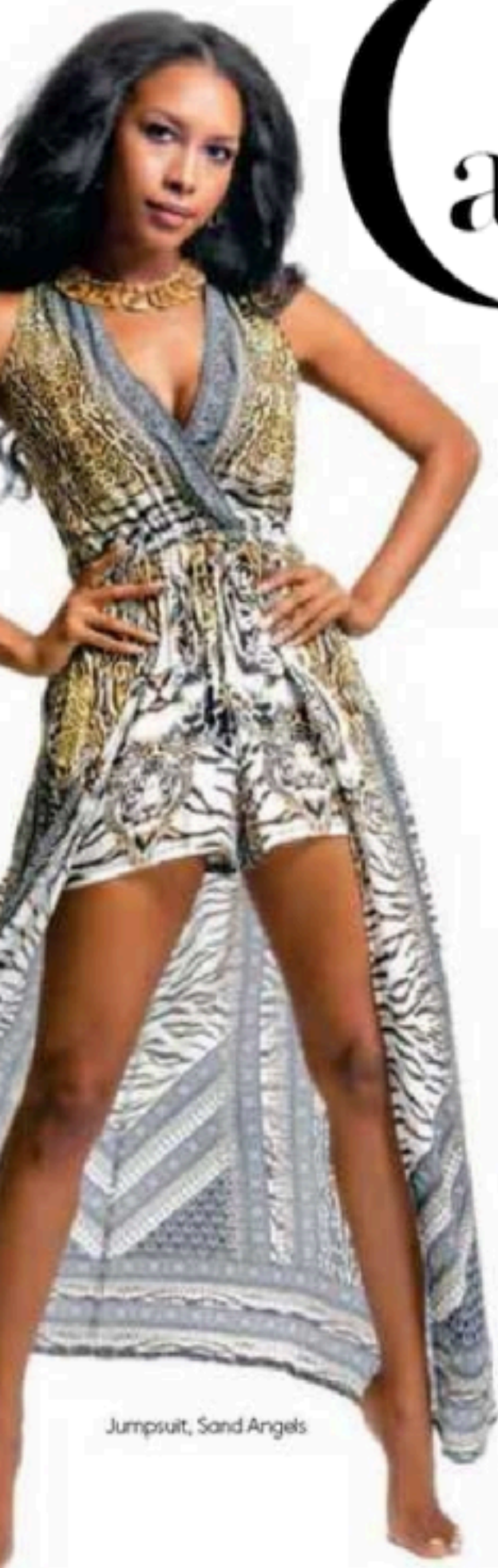
Jumpsuit, Sand Angels