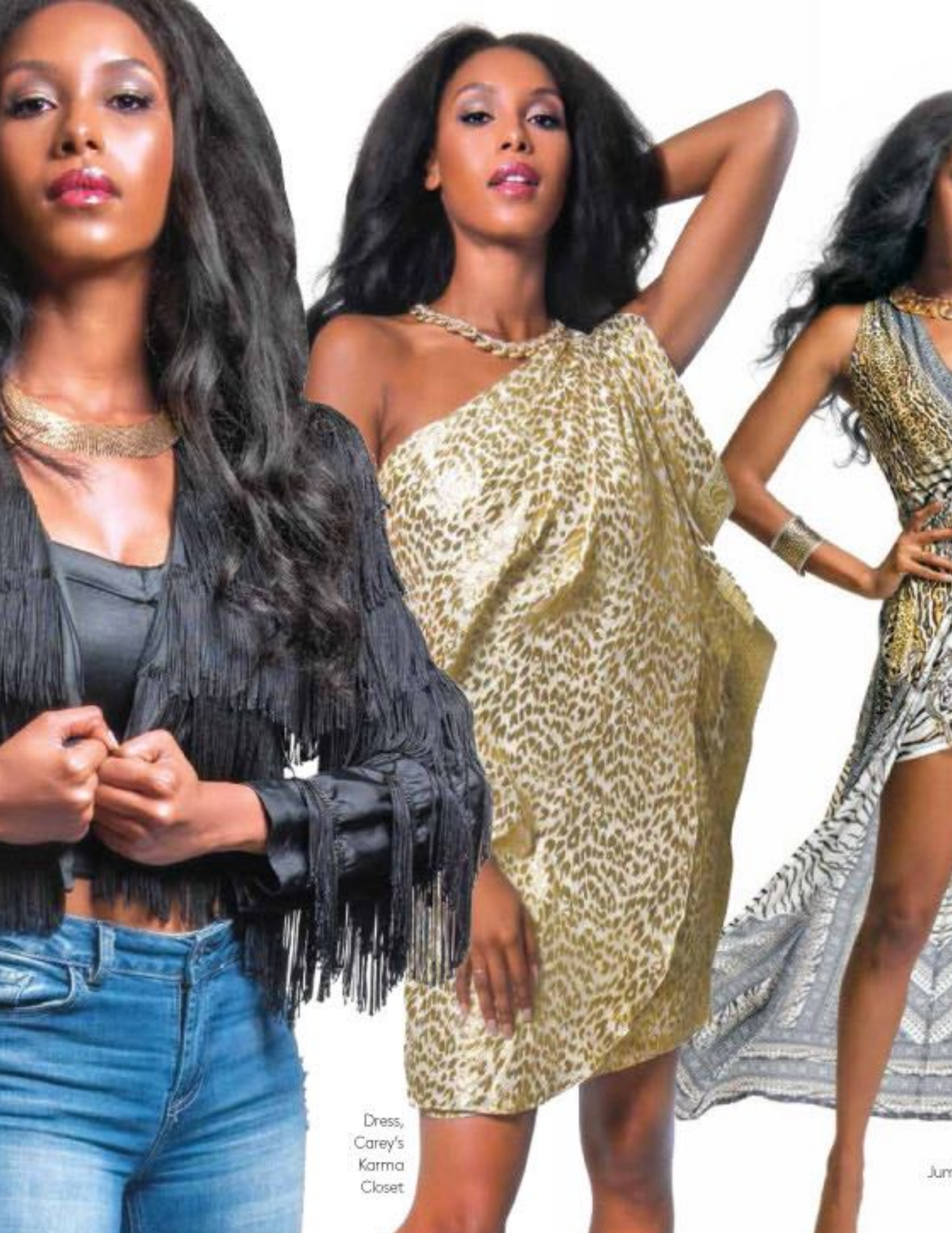
Dress, Carey's Karma Closet